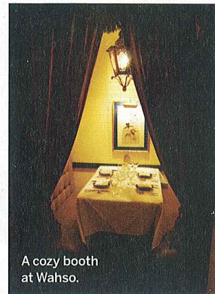
A cozy booth at Wahso.

4) No Name Saloon Try Park City's version of a Happy Meal at this rollicking 1903 watering hole: a half-pound buffalo burger washed down with a couple of locally brewed Polygamy Porters. (You can't have just one.)